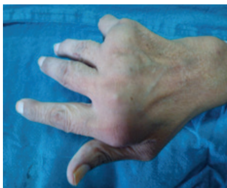
Figure 1: Swelling and deformity of metacarpophalangeal joints of right hand.