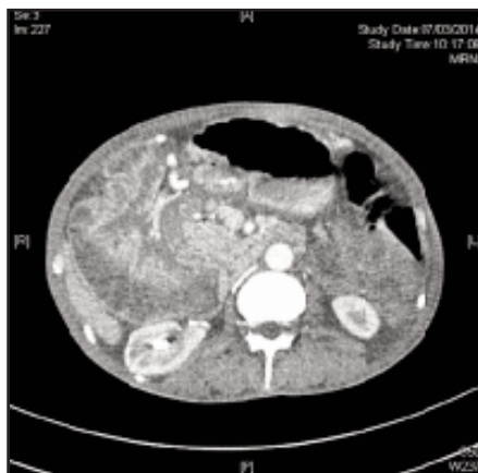
Fig. 1: Classical features of intussusception in CECT.