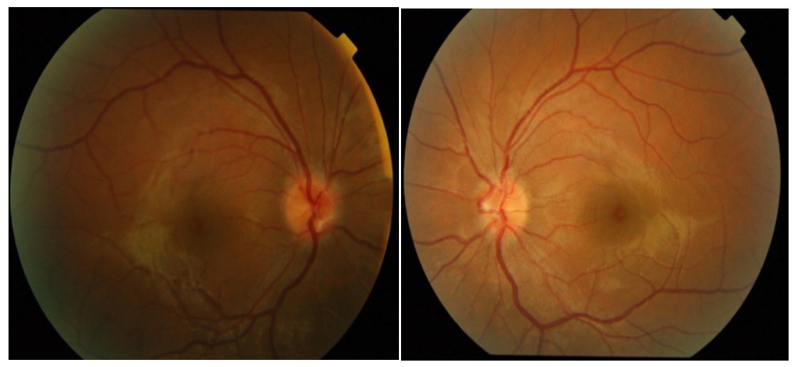
Figure 1: Fundus photograph shows hyperemic and swollen optic disc on both right and left eyes.