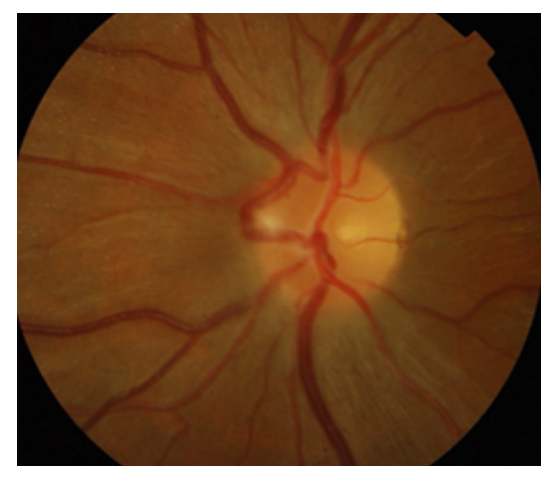
Figure 3: Marked improvement of optic disc swelling at six weeks of treatment.

severe loss of vision is therefore an uncommon clinical feature. The more common scenario is a rapid visual deterioration over a few days.