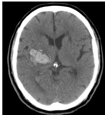
Figure 1. Axial head CT scan obtained after the onset of hemiplegia showing a high density signal in the right thalamic region.

A 71-year-old male suffered a right thalamic hemorrhage before 6 years, which resulted in left spastic hemiplegia (Figure 1). Conservative treatment and rehabilitation were performed,