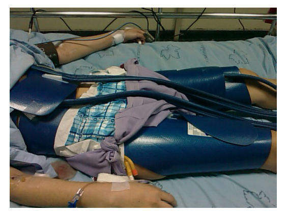
Figure 2. A patient is undergoing targeted temperature management (TTM) with cold water pads.

Indwelling venous catheter with extracorporeal cooling machine is the most common technique for endovascular method. The catheter may be inserted via femoral, subclavian or jugular vein. The machine also comes with the auto-feedback temperature regulation system. Two brands are available in worldwide market including CoolGard 3000<sup>®</sup> and Celcius Control System<sup>®</sup>. Achievement of rapid temperature lowering to the target, tightly maintained target temperature and actively controlled rewarming with endovascular methods have been reported in the literature.<sup>37,38</sup> Shivering control with skin counter-warming can easily be applied to the patients undergoing endovascular