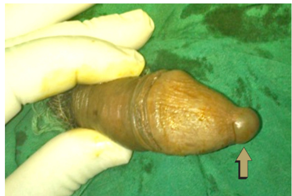
Figure 1: Picture depicting parameatal cyst in an adult.

Parameatal cyst is a rare lesion in male patients and till now around 50 cases have been reported in the literature (2,3). It can occur at any age (4) and the etiology is not fully understood.