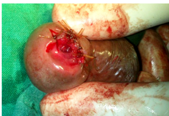
Figure 4: Per-operative picture of urethral meatus after cyst excision and suturing.

It can be congenital or acquired. Thompson and Lantin proposed that it occurs due to delamination or separation of the foreskin from the glans (1). Shiraki suggested that occlusion of paraurethral duct is the probable cause (5). Oka et al., (6) and Yoshida et al., (7) also supported the view of Shiraki. Hill and Ashken were of view that the obstruction of duct is probably due to infection (8). They are usually small cystic mass located at lateral margin of external urethral meatus averaging about 1 cm in maximum diameter (9). Although majority of the patients are asymptomatic, some of them may present with poor cosmesis of genitalia, disturbance in urinary flow, painful sexual intercourse, or urinary retention (4). Cyst may get traumatised and patient may present with bleeding, infection or may spontaneously resolve after rupture. The cyst wall epithelium may be columnar, squamous, or transitional (9). The differential diagnosis includes inflammatory lesion of urethral meatus (9). The treatment of choice is complete excision. Other treatment modalities include needle puncture or aspiration, which invariably results in recurrence, as it happens in one of our cases. Marsupialisation of the cysts results in cosmetically unsatisfactory result. Parameatal cyst is a benign, usually asymptomatic condition. Only a physical examination is sufficient to make the diagnosis and complete surgical excision yields good cosmetic results without recurrence.