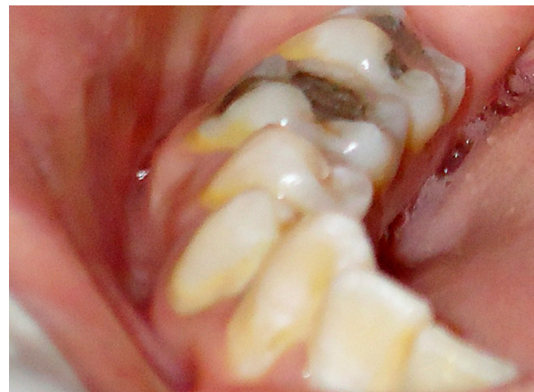
Figure 1: Intraoral photograph of silver amalgam filling i.r.t #46, 47.

On examination, a silver amalgam restoration of the permanent mandibular right first molar (FDI #46) was noticed, which was tender on percussion (Figure 1). On pulp vitality testing, an exaggerated pain response was produced and a provisional diagnosis of irreversible pulpitis was