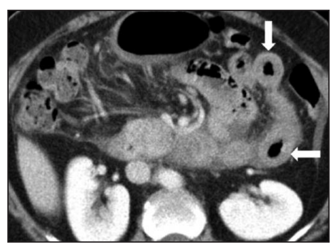
Fig. 2: Axial section from a Computed Tomography of the abdomen performed with intravenous contrast medium showing concentric wall thickening of a segment of the jejunum (white arrows), a relatively common positive radiological finding in our series of patients with EG.

The clinical manifestations of EG may range from mild IBSlike symptoms to acute abdomen due to intestinal intussusception, perforation pancreatitis. 5,6,11-13,15,21,22,26-28 These will depend primarily on the GI tract involvement based on Klein classification. Patient with predominantly mucosal disease present mainly with pain, nausea/vomiting, abdominal diarrhoea, malabsorption, weight loss and protein losing enteropathy. Those with muscular involvement tend to present with bowel thickening and stenosis leading to intestinal obstruction. Serosal involvement will result in eosinophilic ascites. All of our patients exhibited clinical presentation consistent with mucosal involvement. Two patients who had mucosal infiltration may have concurrent serosal and muscular involvement as evidenced by the presence of ascites and