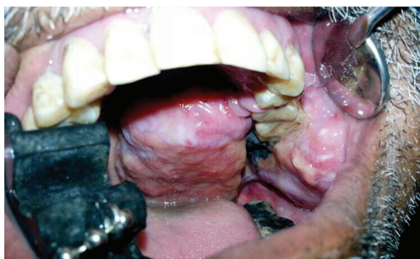
Figure 1: Intraoral examination revealed two large masses on the left hard palate and on the left buccal vestibule.