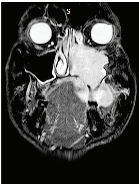
Figure 2: Axial MRI of the lesion showing a large invasive sinonasal mass centred in the left maxillary antrum.

maxillary antrum was found to cause prominent osseous destruction. A massive inferior extension of the tumor was determined through the destruction of the floor of the maxillary antrum and left hard palate. Compression of the left posterior tongue from above, with tumor infiltration of the left buccal space, was observed. Medially, no tumoural extension across the midline to the right side was found. Superiorly, scalloping of the floor of the left orbital, without direct intraorbital tumor invasion, was observed (Figure 2). No metastatic lymph nodes were identified in the imaging. Radiological differential diagnoses were squamous cell carcinoma, adenoid cystic carcinoma, mucoepidermoid carcinoma, or undifferentiated malignant lesion of the left maxillary sinus.