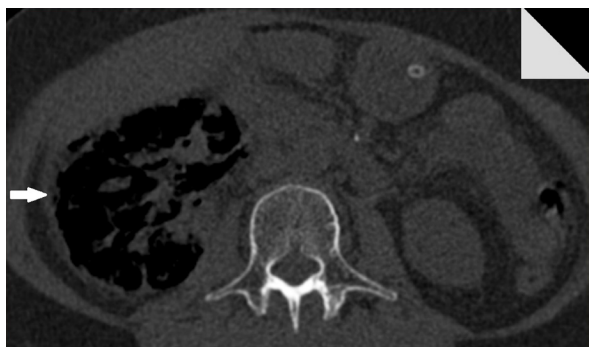
Figure 2: A non-contrast CT scan of the abdomen revealed gas collection in the right kidney.