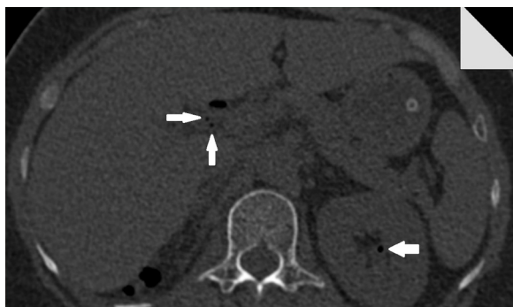
Figure 3: A non-contrast CT scan of the abdomen revealed hepatic portal venous gas and a locule gas over the left kidney.

The mechanism by which HPVG is associated with EPN is unclear. Theoretically, gas from a kidney migrates to the renal vein and subsequently into the inferior vena cava. It does not drain into the hepatic portal venous system. Therefore, the most likely mechanism is the presence of gas-forming bacteria from EPN that haematogenously spread into the hepatic portal venous system. The two most common organisms