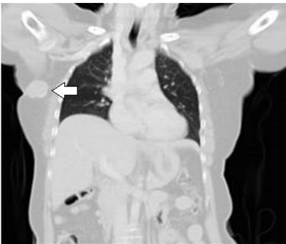
Figure 2: CT scan showed heterogenous lesion at the right axilla with no evidence of distant metastasis (arrow).

Histopathological examination confirmed the diagnosis of leiomyosarcoma (Fig. 3).