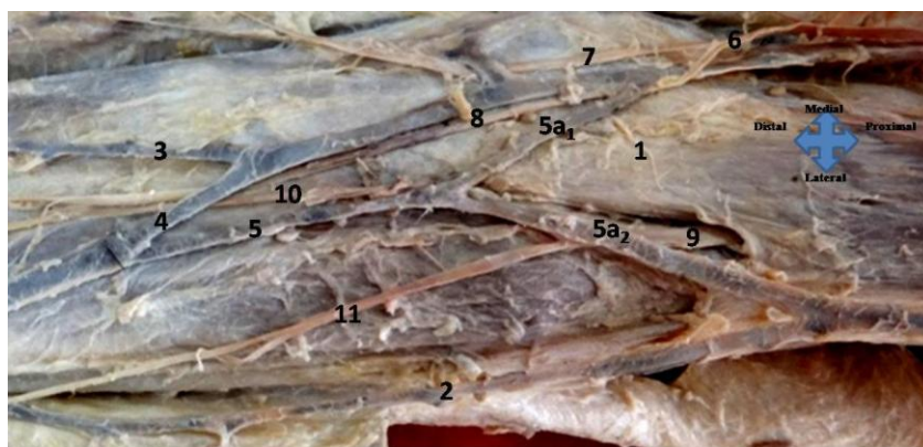
Figure 2: Dissection of elbow region displaying cutaneous nerves related to superficial veins (1. Biceps brachii, 2. Cephalic vein, 3. Basilic vein, 4. Median cubital vein (MCV), 5. Ascending Cubital vein (ACV), 5a1. Medial tributary of ACV (MACV), 5a2. Lateral tributary of ACV (LACV), 6. Medial cutaneous nerve of forearm (MCNF), 7. Anterior branch of MCNF (AMCNF), 8. Posterior branch of MCNF (PMCNF), 9. Lateral cutaneous nerve of forearm (LCNF), 10. Medial branch of LCNF (MLCNF), 11. Lateral branch of LCNF (LMCNF))