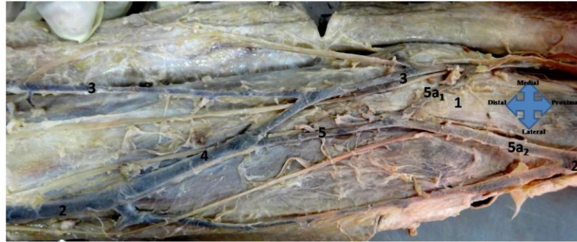
Figure 1: Dissection of elbow region displaying superficial veins (1. Biceps brachii, 2. Cephalic vein, 3. Basilic vein, 4. Median cubital vein (MCV), 5. Ascending Cubital vein (ACV), 5a1. Medial tributary of ACV (MACV), 5a2. Lateral tributary of ACV (LACV))