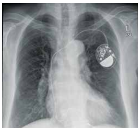
Figure 1. Chest radiograph of the patient

After 4 weeks, the culture grew atypical mycobacterium belonging to Runyon group IV ( M. fortuitum chelonae complex). Subsequently, two more sputum samples were sent for culture and one of the cultures grew the same organism. A respiratory physician was consulted. He advised conservative treatment and not to commence anti-