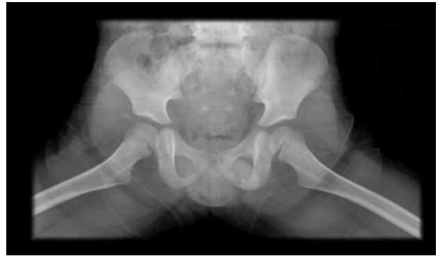
Fig. 1b: Plain frogview radiograph of the hips.