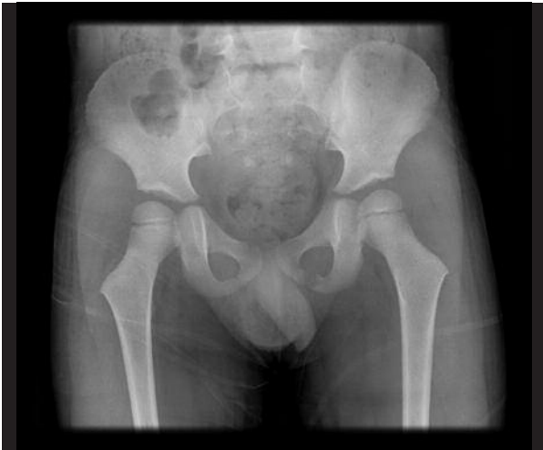
Fig. 1a: Plain AP radiograph of the hips.