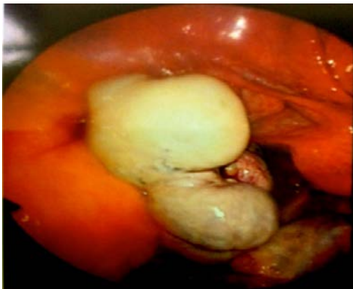
FIG. 1: Laparoscopic view of left ovarian mass

The majority (>90%) of ovarian fibrothecomas are unilateral. They are mostly present in post menopausal women. 5 The presentation of our patient was unusual as she did not complain of abdominal bloating, ascites or pleural effusion that can be present with pelvic tumours as described in Demons-Meigs syndrome. 6