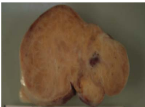
FIG. 2: Macroscopic view of the cut section of left ovarian mass.