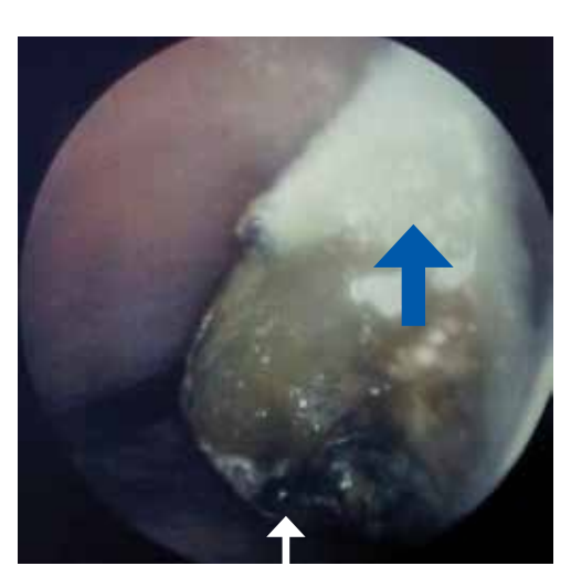
Figure 1. Rhinolith (white arrow) and septum (blue arrow) of the right nasal cavity upon endoscopy

mass was apparently seen on the floor of the right nasal cavity. Nasoendoscopic examination revealed a mass occupying the space between the inferior turbinate and septum in the right nasal floor (Figure 1). The mass was dark in colour with mucus overlying it. It was stony hard and gritty in consistency on probing. These findings were consistent with right rhinolith. The left nasal cavity was normal. The rhinolith was completely removed by application of local anaesthesia as outpatient (Figure 2). On crushing the rhinolith, no obvious nidus was identified (Figure 3). The patient was then prescribed a course of oral antihistamine and nasal douching.