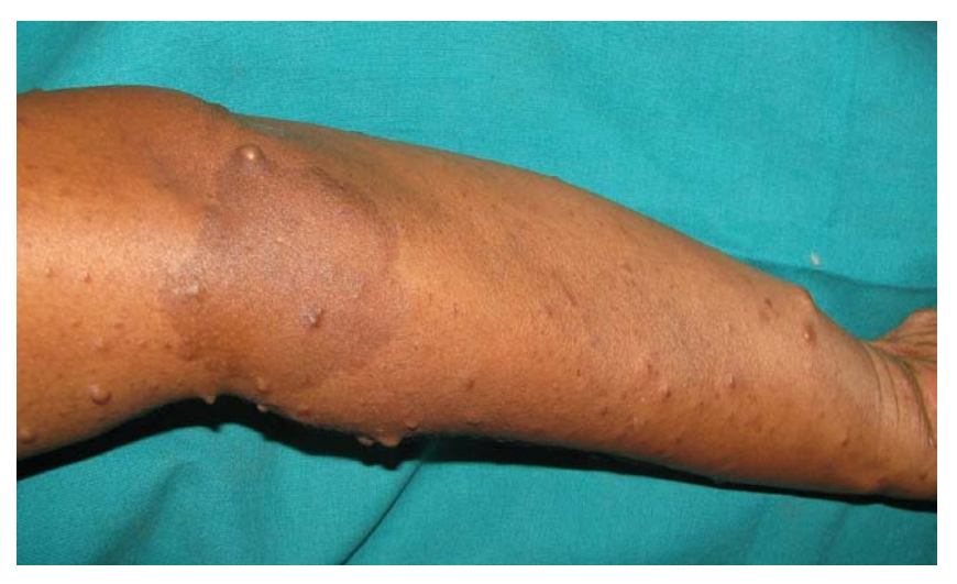
Fig. 2 Café a lait spot with multiple tiny neurofibromas on the left arm.

Fig. 1 Intraoral appearance of the lesion (arrow) on the left mandibular interdental buccal gingiva.