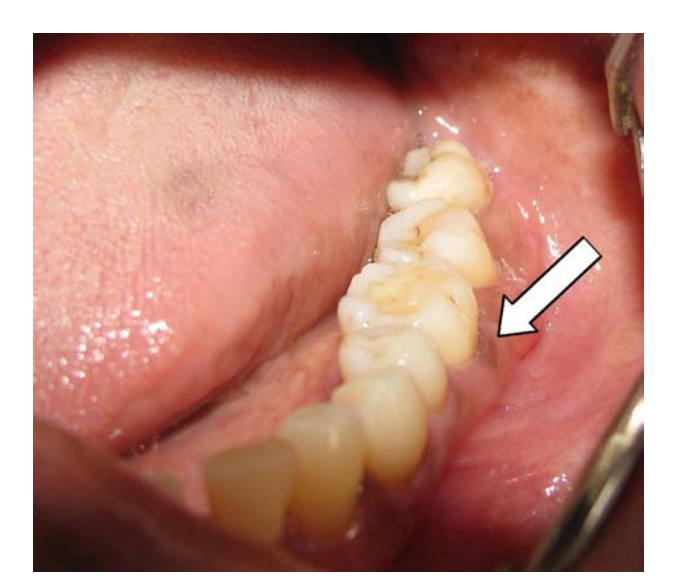
Fig. 1 Intraoral appearance of the lesion (arrow) on the left mandibular interdental buccal gingiva.