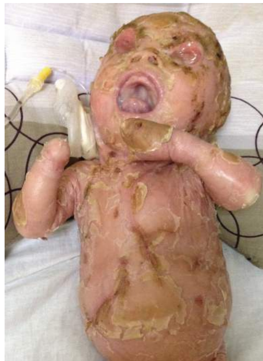
Figure 2 Generalized thick, large, brownish and adherent plate-like scales at 10 months of age.

On physical examination, the patient had normal vital signs. His weight (3.4 kg; z-score <-3) and length (51cm; z-score <-3) suggested severe underweight and severe stunting. The skin showed generalized thick, large, brownish, adherent, scaly plates with crusting and fissures (Figure 2). The scalp had alopecia. Facial features included bilateral ectropion with purulent eye discharge, bilateral atrophic globes, eclabium, and hypoplasia of the ears and nose. Both upper and lower extremities had limited