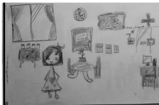
#11. Sibling 8yo/F