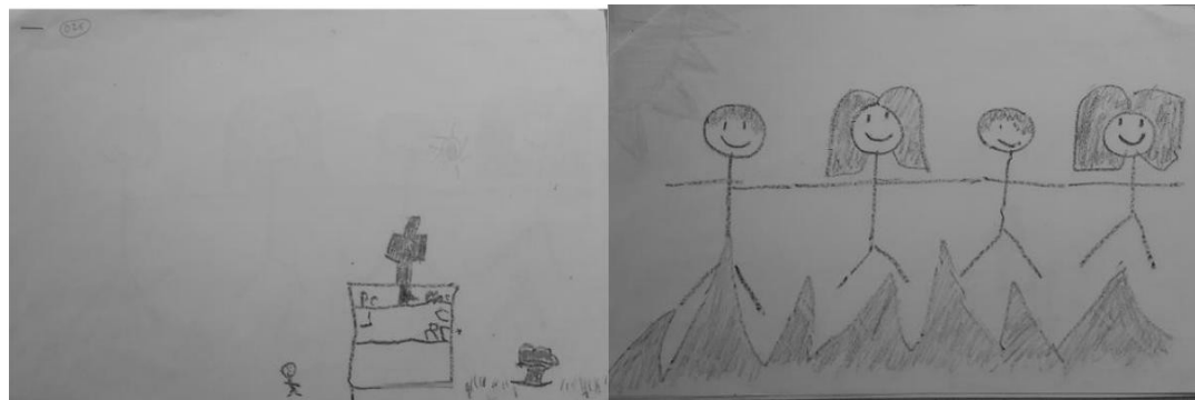
#25. Patient 10yo/M