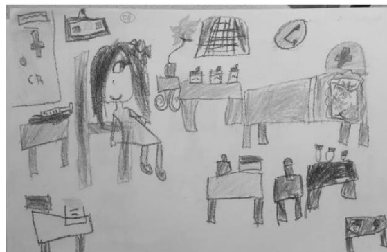
#11. Patient 7yo/F