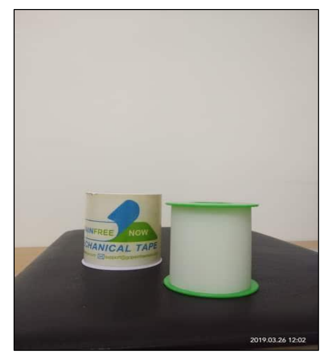
Figure 1. The BMT fascia tape that was used in the study.

Outcome Measures . Visual Analog Scale (VAS) for pain (Appendix A) and Foot and Ankle Ability Measure (FAAM) (Appendix B) for function were used to determine the effectiveness of BMT and PT on acute ankle inversion sprain.