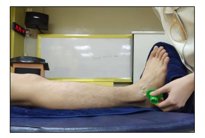
Figure 3. Second BMT fascia strip. The second strip of BMT fascia was anchored on the participant's skin overlapping the first BMT fascia strip. The tape was pushed towards the posterior aspect of the ankle by the investigator creating a skin lift (green arrow) over the painful area. The distal end of the second BMT fascia strip was anchored laterally to the Achilles tendon.

Figure 2. First BMT fascia strip. The participant was in a long sitting position with the injured ankle placed in a neutral position. The first strip of BMT fascia tape was applied without tension over the painful lateral ankle area.