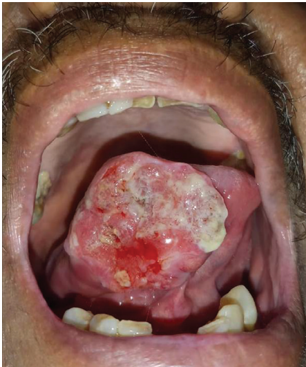
Figure 1. There were ulcers with irregular edges and induration.

The follow-up therapy was hemiglossectomy, then followed by a histopathology examination obtaining the invasive squamous cell carcinoma, moderately differentiated, perineural invasion was present, metastasis in 1 out of 36 lymph nodes, Stage III pT3N1M0, Right Neck, Right FND: Present Metastatic of Squamous Cell Carcinoma in 1 out of 36 Lymph Nodes; Less Than 3 cm; Without Extranodal (Figures 2 and 3).