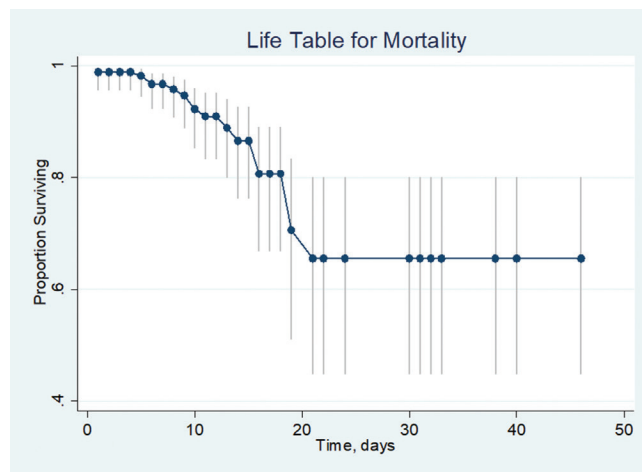
Figure 1. Life table for mortality, n=180 .

among ICU-admitted patients. The proportion of patients who received vitamin D3 or zinc were not significantly different between ward-admitted and ICU-admitted patients.