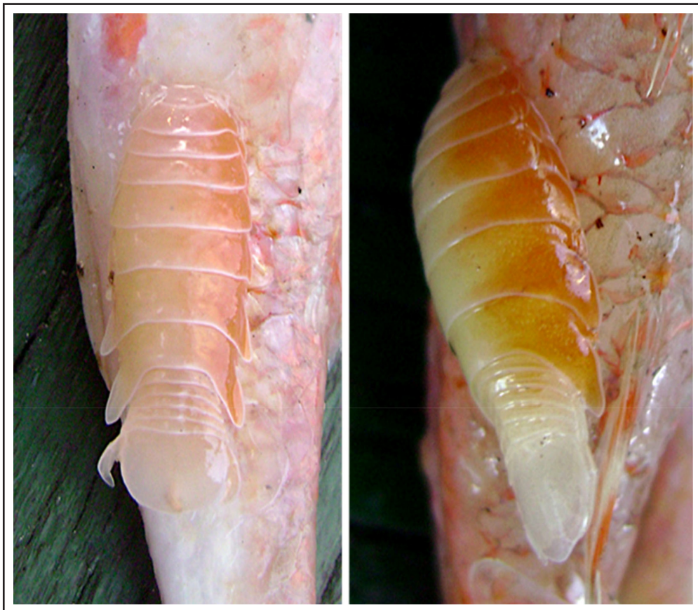
Figure 2. Renocila richardsonae attached on the body of two different Upeneus japonicus .