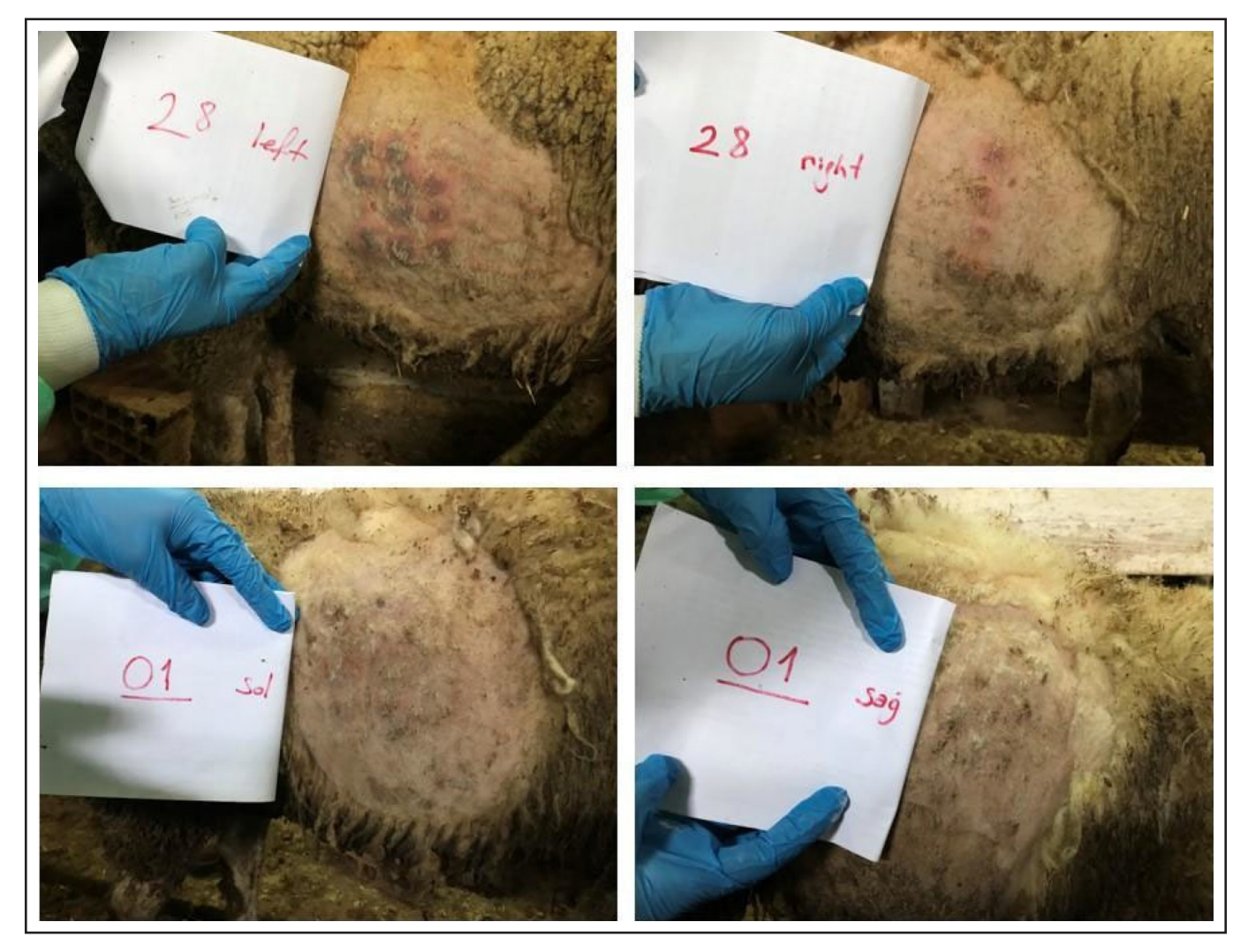
Figure 2. Comparison of skin reactions of protected and non protected animals in the simultaneous vaccination group. Skin reactions of non protected animal after simultaneous vaccination (28: animal code) at 8. Days Post Challenge (DPC) and skin reactions of protected animal after simultaneous vaccination (1: animal code) at 8. DPC (left and right sides of body).

When we look at the studies that gained successful results, in a study (Srinivasan, 2001); FMD, rabies, Pasteurella, and Clostridium vaccine agents were used in the combined formulation. Formulating the many vaccines in a one syringe can help the workload of field vaccination, but, some drawbacks are possible. For example, negative interference may decrease the protective immune response to one or more component of the candidate vaccine, combined vaccines are more prone to shortage because of its complex nature, the risk is increased if one batch of combined vaccines can not pass one of the vaccine control tests. For this reason, simultaneous vaccine administration is more preferable than combined vaccine administration (Fletcher et al., 2004). Therfore, here simultaneous vaccination was preferred. In other two different studies (Trotta et al., 2015; Çokçalışkan et al., 2019), FMD and anthrax vaccines were used simultaneously without any interference. Live attenuated Brucella and FMD vaccines in cattle were used simultaneously and researchers declared that the antibody titers against Brucella were higher during the simultaneous administration (Hancı, 2016). The vaccine agents of these three studies are composed of live bacterial agents (anthrax and brucella) and it was the positive effects on the cellular immune response through cytokines. This is probably the main reason why succesful results were gained in these studies.