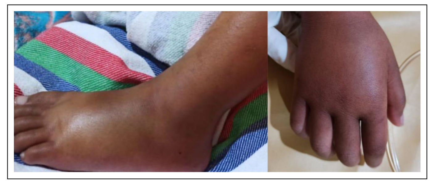
Figure 1. Edema in both extremities. Erythematous rash and swollen feet and hands on the first day of admission. The edema was non-pitting and mildly tender.