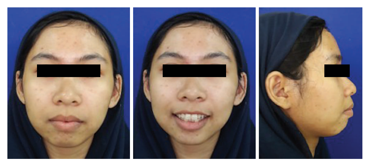
Figure 1. Pre-Treatment Extra Oral Photographs.