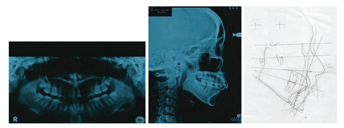
Figure 5. Post Treatment OPG and Cephalogram.

and extraction. Extraction of all first premolars is usually indicated in moderate to severe crowding in the labial segment to create space for relieving of crowding. It is the commonest pattern of extraction done by the orthodontist, as it is cantered between the anterior and posterior region of the jaw, and it provides good anchorage in the posterior region to retract the six anterior teeth.<sup>4</sup> Persson et al. (1989) also examined the spontaneous long-term changes following premolar extractions alone, and found marked spontaneous arch alignment and residual space closure with age.<sup>7</sup>