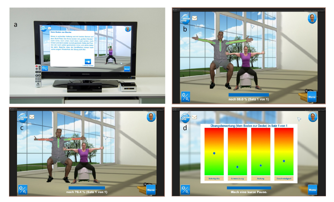
Figure 1. a: shows the hardware components including the Kinect-box and the TV-screen showing the avatar of the therapist and the instructions for the patients; b: shows the therapist and the patient as avatars with positive (green) feedback; c: negative feedback (red); d: feedback screen after each exercise to size of steps, amplitude of arm movement, position and speed.

Thirty-four patients with PD were included in the study. The following inclusion criteria were applied: diagnosis of idiopathic Parkinson's disease with mild to moderate symptoms (Hoehn & Yahr I-III), no restrictive cardiovascular