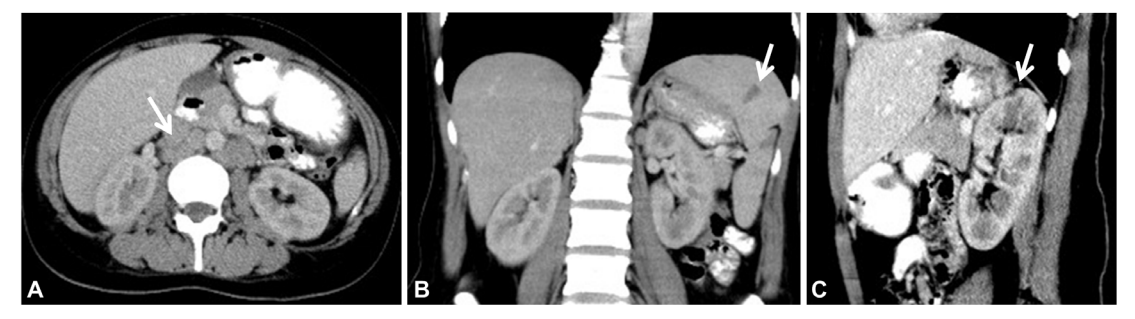
Figure 3. A) Axial CT of abdomen and pelvis showing multiple paraaortic nodes (white arrow) B) coronal and C) left parasagittal view showing multiple hypodense wedge-shaped lesions on the spleen (white arrow) and left upper pole of kidney (white arrow) suggestive of infarcts.

When there is a high index of suspicion, TTE followed by TEE (if the former was negative), should be performed to search for vegetations.<sup>5</sup> Interpretation of echocardiography is subjective and can be unreliable in certain cases. Two-