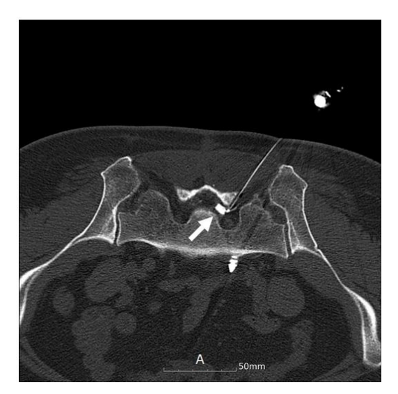
Figure 2. The contrast media (arrow) showed loculation near the injection site without diffusion in the epidural space.

Approximately 1 hour after the procedure, the patient complained of weakness in the right ankle dorsiflexor. The manual muscle test (MMT) result of the tibialis anterior muscle was Medical Research Council (MRC) grade 4. Administration of intravenous normal saline was started. The weakness of the right tibialis anterior muscle