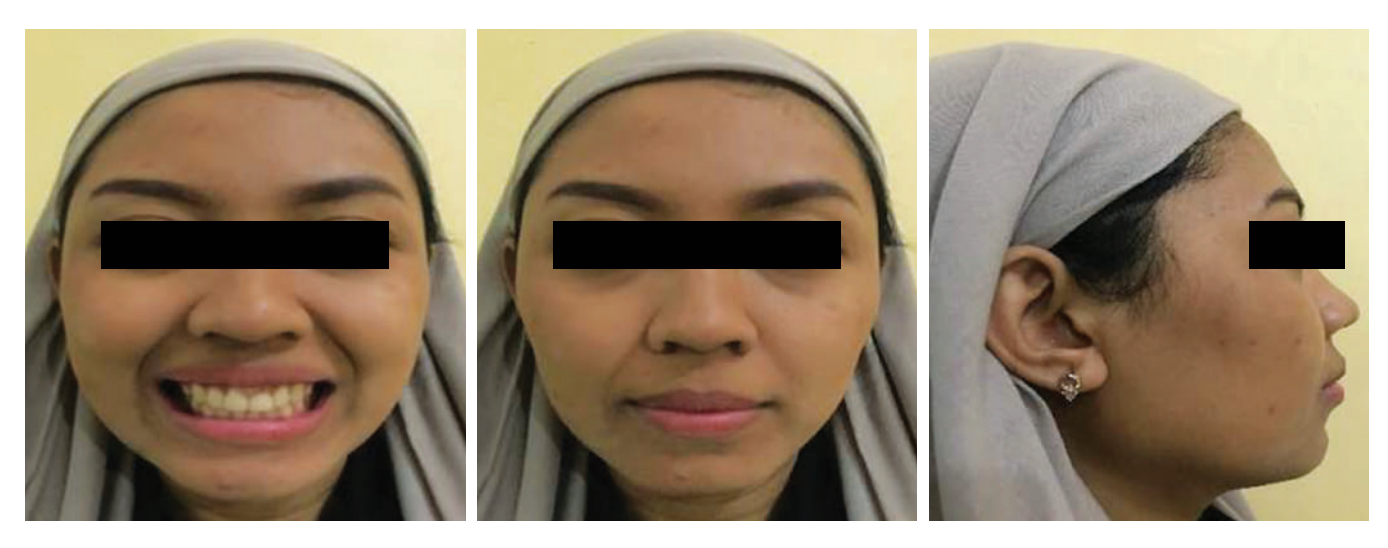
Figure 6. Extraoral facial profile post-treatment.