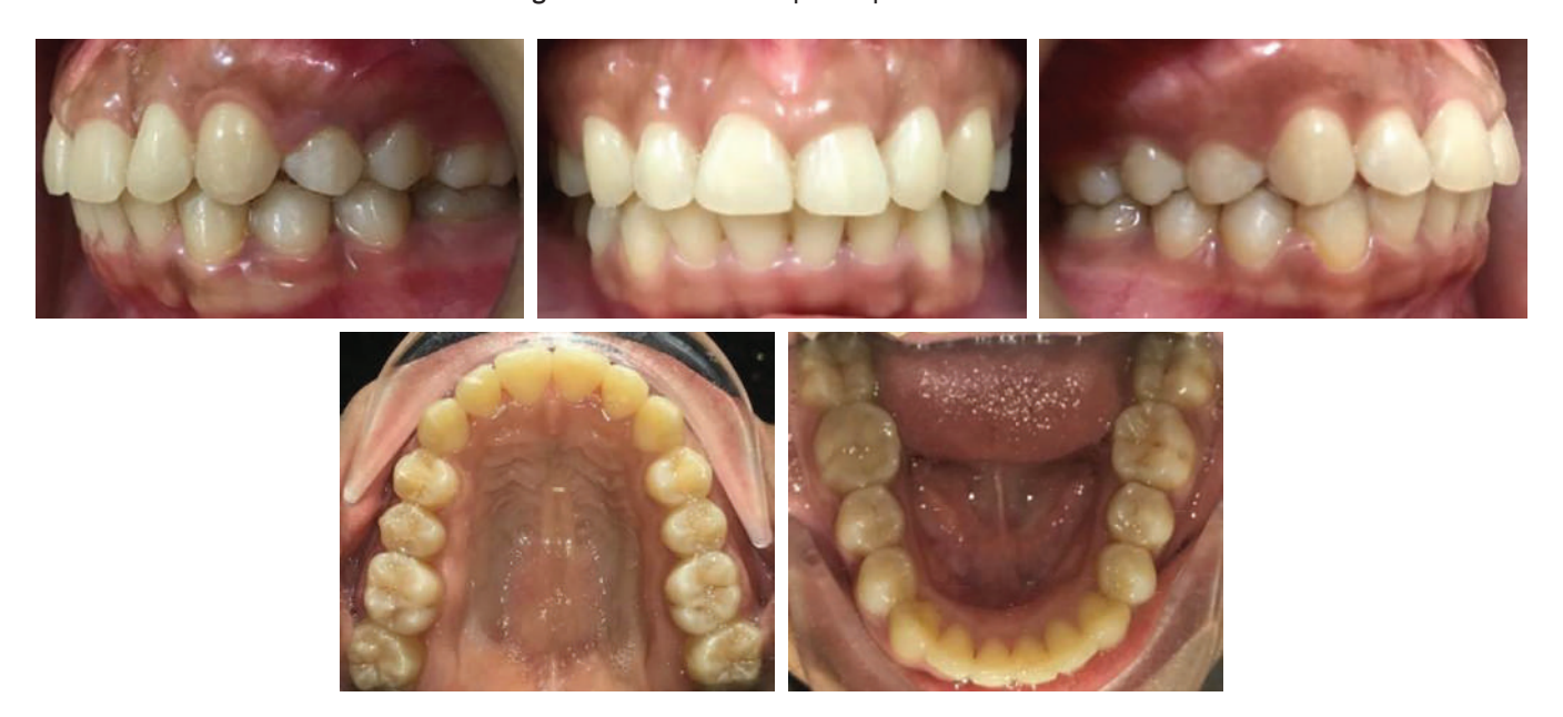
Figure 7. Intraoral post-treatment.