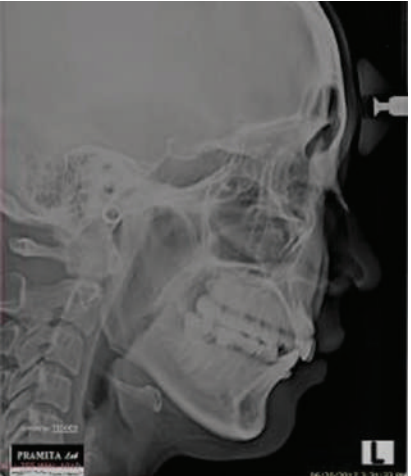
Figure 3. X-rays pre-treatment.