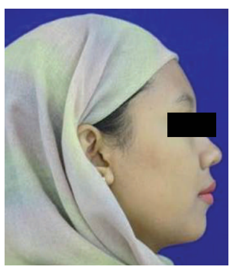
Figure 1. Extraoral facial profile pre-treatment.