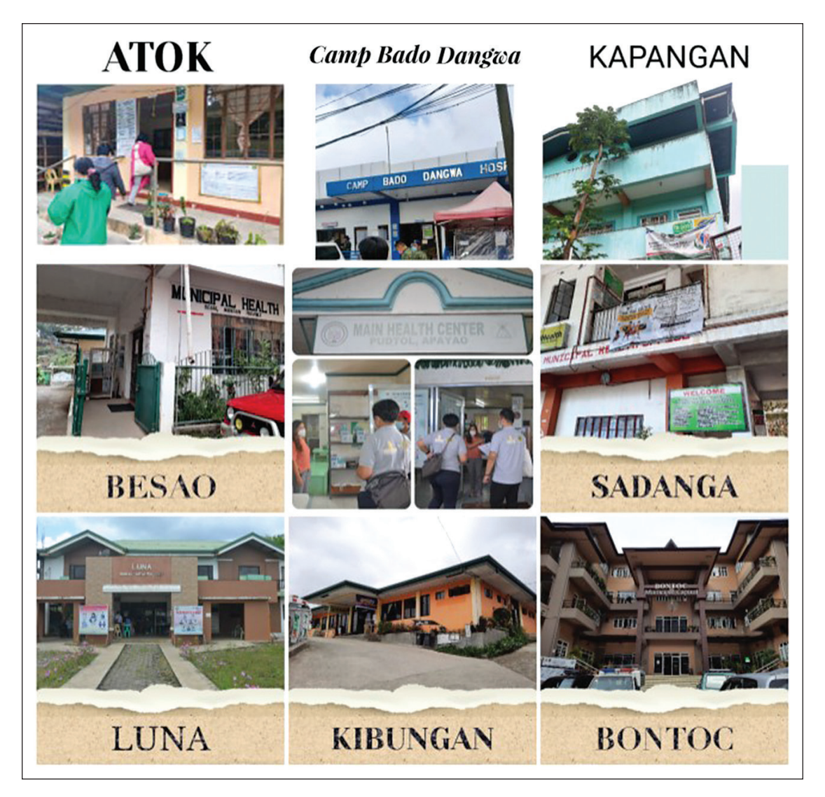
Figure 1. Examples of facilities visited in CAR.

In terms of personnel capacity, CAR had the lowest performance compared to the other Luzon regions. It had the lowest rate of administering parenteral antibiotics and uterotonics. Only one facility (3.23%) administered anticonvulsants in CAR as compared to 34.29% in the entire Luzon. Only one facility (3.23%) in CAR performed assisted imminent breech delivery, the least in Luzon. Newborn resuscitation and partograph review were least done in CAR.