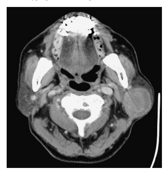
FIG. 1: Left parotid gland tumour sized 4.5 x 3.1 x 3.3cm with the mixed content of solid and cystic parts on CT scan with contrast.

The patient received left superficial parotidectomy, which is corresponding to left parotidectomy I-II of European Salivary Gland Society (ESGS) classification, and the entire lesion was totally removed by en bloc resection with the surrounded parotid gland.5 Grossly, the tumour was well circumscribed, solid-cystic and yellow-brown on cut. Microscopically, the sections showed a mixed solid and cystic lesion within an intra-parotid LN. (Fig. 2A) The cyst was lined by single to multilayered ductal epithelial cells with foci of micropapillary growth along the cystic wall. (Fig. 2B) The solid part was composed of intraductal proliferation of neoplastic cells in solid, glandular, cribriform, micropapillary and Roman bridge-like structures. (Fig. 2C) The growth patterns were reminiscent of those seen in mammary usual and atypical ductal hyperplasia or low-grade ductal carcinoma