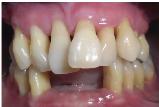
Figure 5. Marked resolution of inflammation with marked gingival recession.

The patient was provided with insulin and glucose strips for blood glucose home monitoring up to November. The patient was also provided with a toothbrush, triclosan/copolymer toothpaste, dental floss, an interdental toothbrush, 0.12% chlorhexidine gluconate mouthwash (up to 6 weeks post-root planing) and a 0.075 cetylpyridinium chloride mouthwash (after 6 weeks post-root planing). Oral hygiene instructions were again given. The teeth were then divided into sextants and treatment (scaling and root planing) was performed beginning with