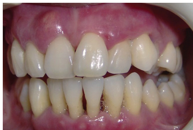
Figure 2. After 3 rounds of scaling.