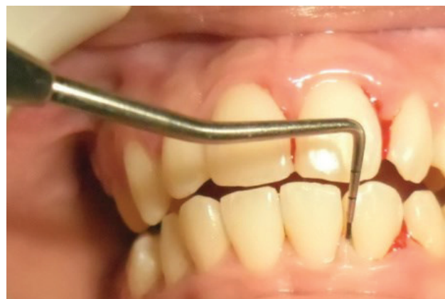
Figure 3. Example of recording pocket probing depth and bleeding on probing.