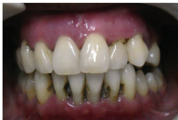
Figure 1. Patient's initial appearance, March 3, 2012.

when no mobility was detected, 1 when there was less than a millimeter (mm) of mobility detected, 2 when there was a >1 mm mobility detected (Table 1). Caries or tooth decay was found on the following teeth: 15, 26, 27, 36, 46, and 47. Tooth numbers 18 and 28 were impacted. Tooth numbers 13 and 37 had periodontal pockets less than 6 mm while all remaining teeth had pockets greater than 6 mm (Table 1). Except for tooth numbers 47, 46, 36, and 37, all the other teeth had 50% or less remaining bone support based on the panoramic x-ray (Figure 4).