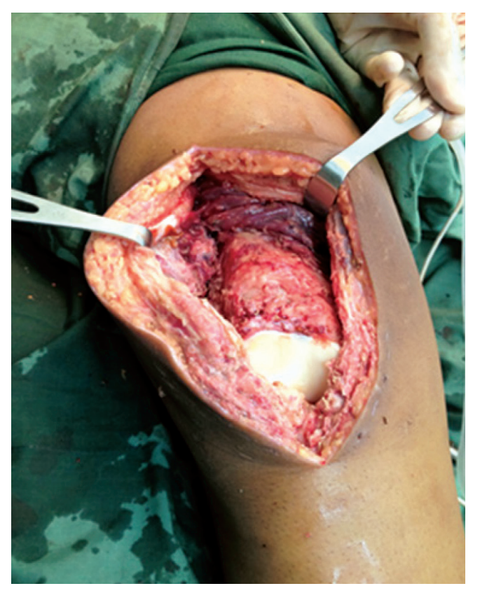
Figure 3. Post-excision of anteriorly located mass.