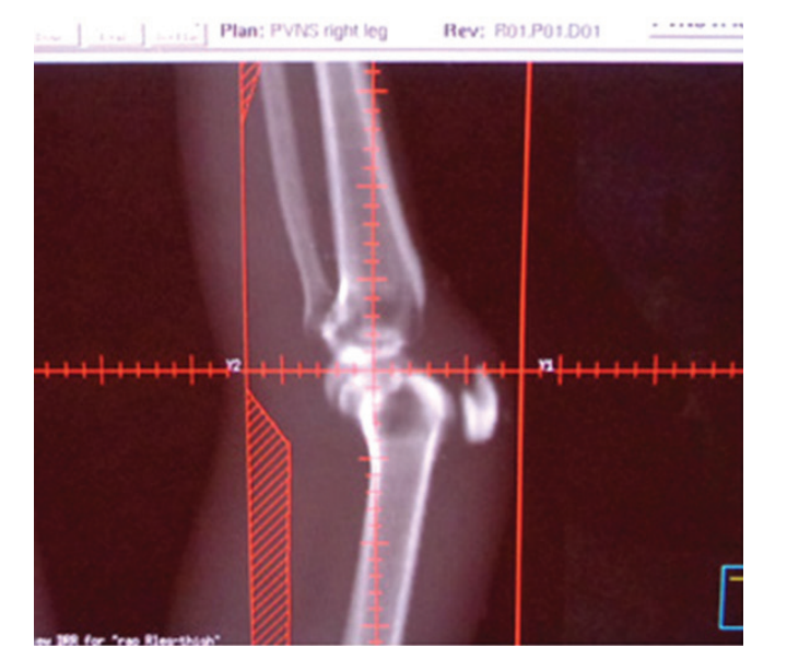
Figure 4. Right anterior oblique field to the right medial thigh.

Radiographically, there are typical but nonpathognomonic imaging findings on x-ray. There will be a non-calcified soft tissue mass, well-defined bone erosions on both sides of a joint and occasionally, joint effusion. The most characteristic are the multiple erosive lesions on both sides of the joint. Unfortunately, x-ray findings such as presence of osteophytes, sclerosis, cysts and joint narrowing