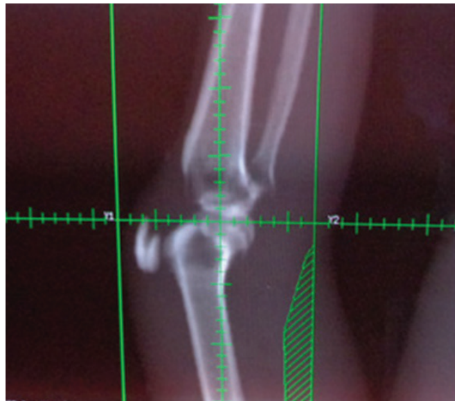
Figure 5. Left posterior oblique field to thigh and knee.