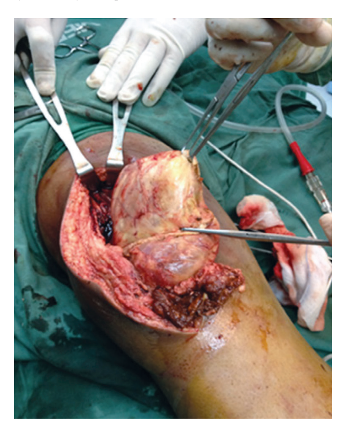
Figure 2. Main bulk of PVNS at suprapatellar area being excised.

and the mass was excised along its pseudocapsule at the suprapatellar region (Figures 2 and 3). Intralesional excision was performed at the medial and lateral compartments. Intra-operatively, there was a rust-colored intracapsular knee mass that extended from the distal thigh, crossing the knee joint and spreading toward the posterior leg. The cruciate ligaments, menisci, and articular cartilage all appeared