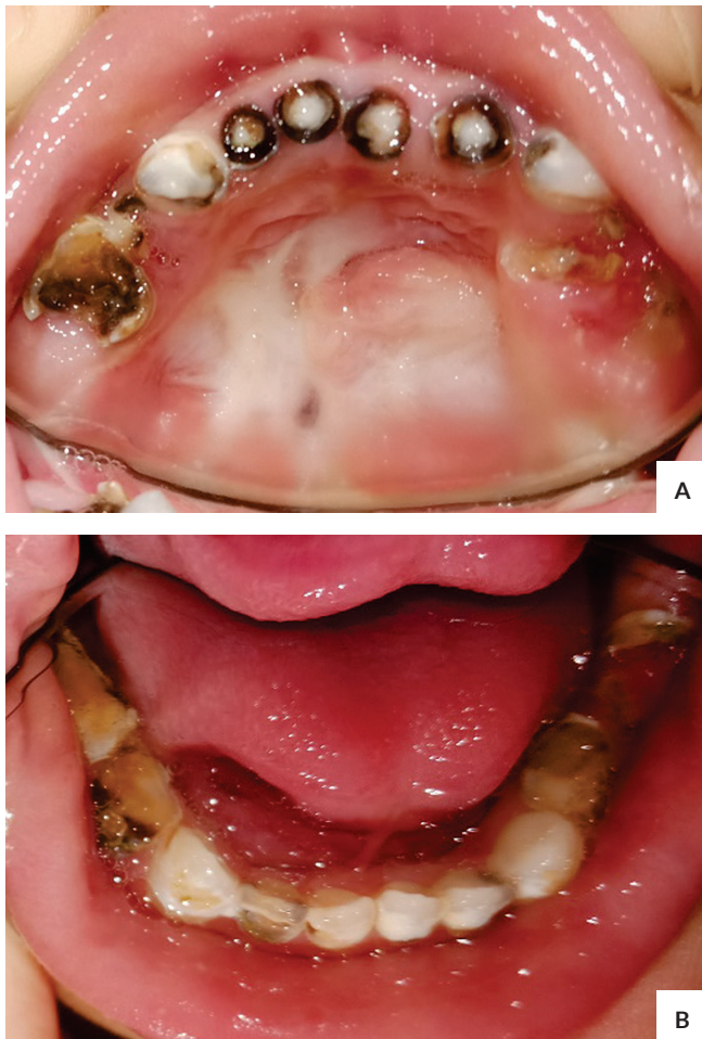
Figure 2. Intraoral examination before treatment (A) the maxilla arch revealed multiple dental caries of 55, 54, 53, 52, 51, 61, 62, 63, 64, 65 and cleft palate (B) the mandibular arch revealed multiple dental caries of 75, 74, 73, 72, 71, 81, 82, 83, 84, 85.

WBS which increased the risk of dental caries. Since the parents focus on their child's medical treatment it caused less attention to oral hygiene. Dental caries was the most common oral disorder. Based on World Health Organization's data, dental caries emerges as one of the oral disorders leading to a person's lower life quality, both aesthetically and functionally. 8