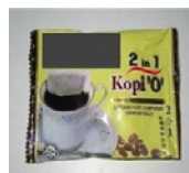
2-in-1 Instant Coffee mix