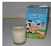
Low fat milk