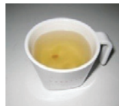
Clear Chicken Soup