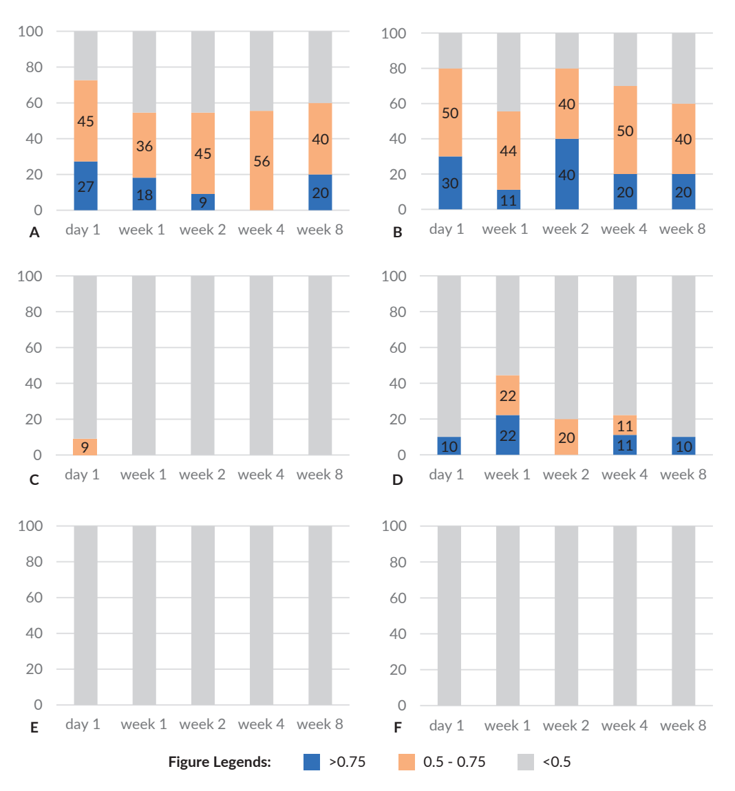
Figure 2. Proportion of eyes with ≥0.5 D change in spherical equivalent and astigmatism based on clinical refraction. (A) proportion of eyes that showed ≥0.5 D change in spherical equivalent for the recession group; (B) values for the R&R group; (C) proportion with changes in J0 in the recession group; (D) values for the R&R group; (E) proportion that showed ≥0.5 D change in J45 for the recession group; (F) values for the R&R group. J0, vertical astigmatism; J45, oblique astigmatism, calculated using Miller's formula.

rectus recession of Graves' disease patients.<sup>8</sup> This was also seen by Bae and Choi during the 1<sup>st</sup> week postoperative follow-up, but measurements reverted back to original after 3 months.<sup>15</sup>