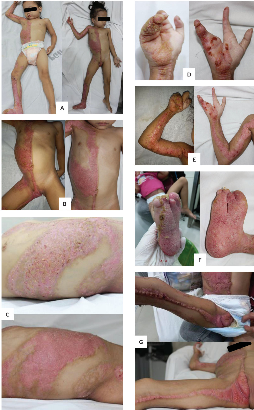
Figure 3. Photos taken baseline and at Week 16 of treatment. Noted decrease in erythema, thick verrucous yellowish plaques with areas of excoriations and scaling (A-G).