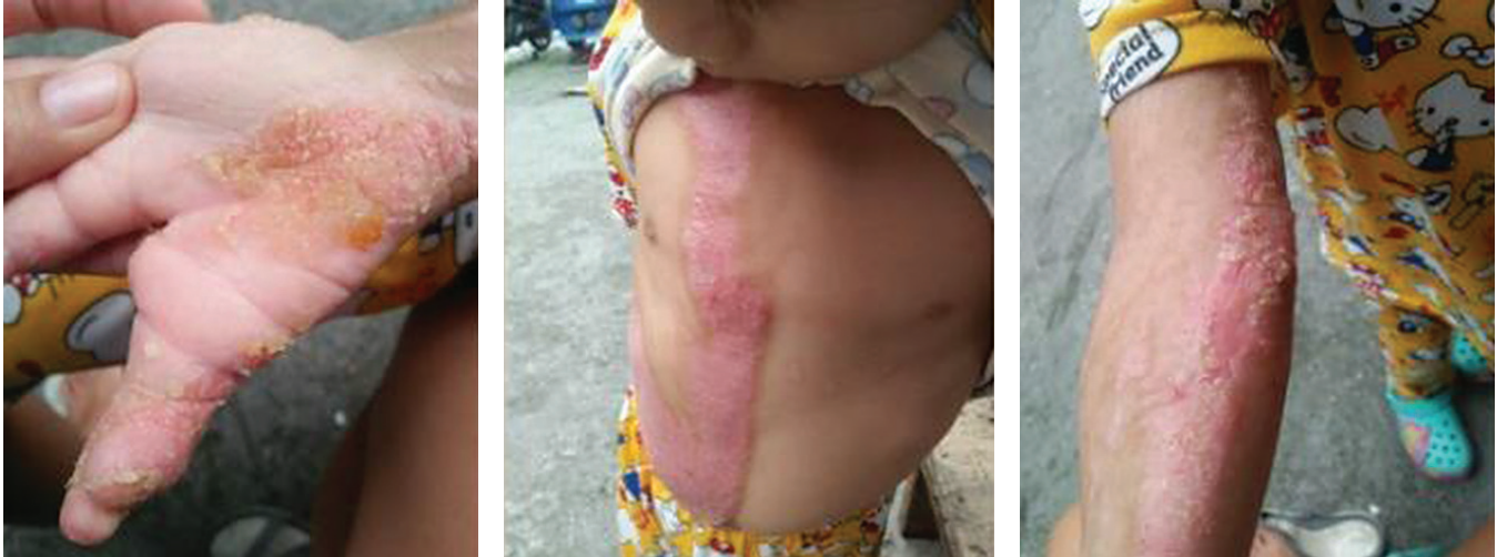
Figure 4. Photos taken after one month of treatment, sent via teleconsultation. Noted further decrease in erythema, thickness of verrucous plaques and scaling. Patient reports controlled pruritus.