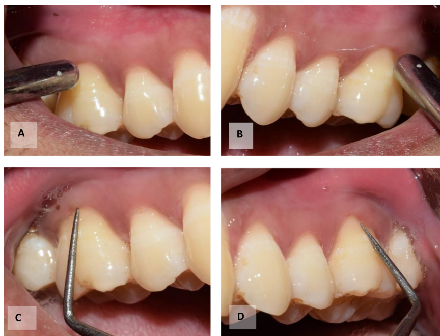
Fig. 2 Evaluation of patient’s response to air and tactile stimulus. (A) and (B) Air blast using three-way syringe at test and control sites, respectively; (C) and (D) Tactile stimulus provided using straight probe at test and control sites, respectively.