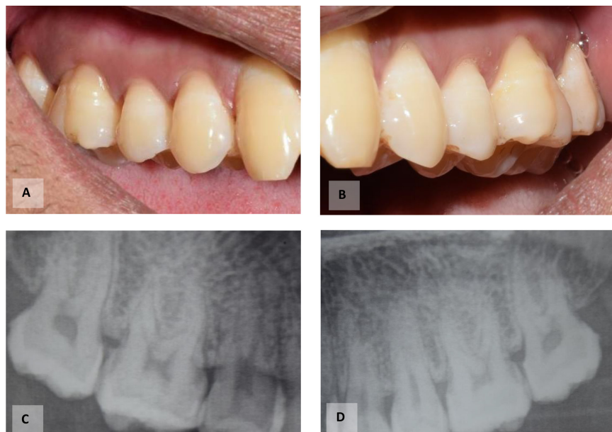
Fig. 1 Test and control sites (16 and 26, respectively) with Miller's class I gingival recession and DH. (A) and (C) Clinical and radiographic picture of the test site; (B) and (D) Clinical and radiographic picture of the control site.

In the control surfaces, sodium fluoride varnish was applied with applicator tips at the cervical region (Fig. 3A) and allowed to dry. After drying, another coat of varnish was applied. In the test surfaces, diode laser was used for 30 sec in continuous wave and non-contact mode in cervical areas (Fig. 3B), with tip at a distance of approximately 2 mm under the output power