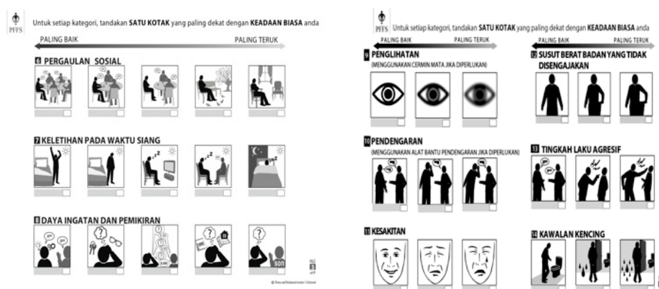
Figure 3. Acceptability questionnaire

Please give us your overall opinion about the scale by marking an X in one of the boxes indicating your degree of agreement or disagreement with the following statements.