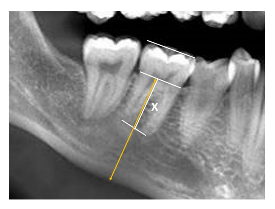
Fig. 3 The method to obtain R/M ratio, by extrapolating a line from X all the way to the lower border of the mandible (shown as a yellow line with double arrows ends).