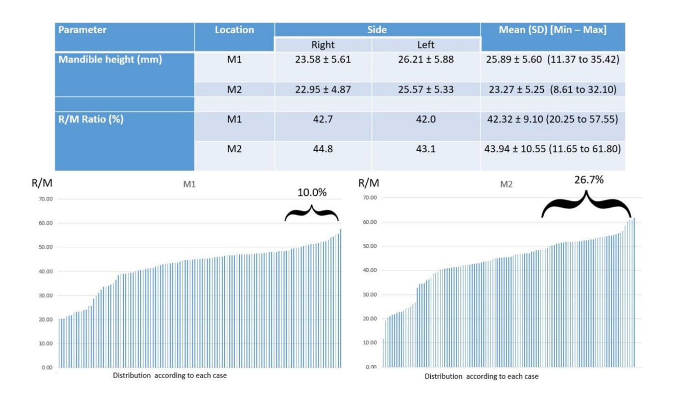
Fig. 4 Details of mandibular height, root to mandible height ratio, and their distribution.

M1 is 7.5 mm and 14.0 mm, respectively; this gives M1 the length of 21.5 mm. M2 has been reported to have a crown height of 7.0 mm and root length of 13.0 mm; this then gives it the tooth length of 20.0 mm. Overall, Kim et al. (2005) found that tooth lengths of Asian (Korean) were shorter than Caucasians. The mesial and distal roots of the M1 were between 1.5 mm and 1.8 mm shorter than their Caucasoid counterparts. For M2, their roots were 1.5 mm to 2.3 mm shorter. Eliasson et al. (1986) reported slightly longer M1 and M2 of between 21.5 mm and 22.5 mm in the Swedish population, which they attributed to radiographic elongation as their method of study was via the use of periapical radiographs.