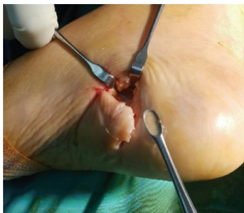
Figure 4: Intraoperative findings of an intramuscular abscess between the flexor digitorum brevis and plantar fascia.

The plantar fascia is a thickened fibrous aponeurosis that originates from the medial tubercle of the calcaneus. It inserts into the deep transverse ligaments of the metatarsal heads and forms the fibrous flexor sheaths on the plantar aspect of the toes. 2 Pain sensation is registered and mediated by the small plantar nerves in and around the plantar fascia. Plantar fasciitis pain is caused by the degenerative irritation at the insertion of the plantar fascia on the medial process of the calcaneal tuberosity. The typical presentation is a sharp pain localized at the anterior aspect of the calcaneus. The etiology of this condition is multifactorial; however, most cases result from overuse stresses. Risk factors of developing plantar fasciitis include having pes planus or heel spurs, obesity, as well as occupations that require prolonged standing. 3