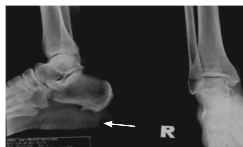
Figure 2: Right ankle x-ray showing lytic lesion at the calcaneum (white arrow)

Blood investigation results indicated that the HbA1C reading was 7.4%, whereas WCC and CRP were both within normal range. There was an elevated ESR of 51 mm/hr in view of the chronic condition. A right ankle radiograph revealed a lytic lesion over the calcaneum ( Figure 2 ). Magnetic resonance imaging (MRI) revealed a right flexor digitorum brevis intramuscular abscess with focal osteomyelitic changes of the adjacent calcaneum ( Figure 3 ).