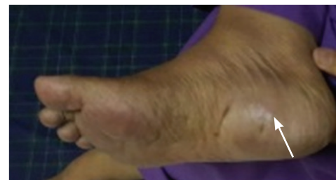
Figure 1: Right medial heel swelling with sinus opening (white arrow).

conservatively with analgesia and physiotherapy. After about 3 months, the pain worsened, and she opted for an injection of a local anesthetic combined with a corticosteroid in her right heel as the treatment plan. The pain worsened 2 weeks post-injection and was complicated by a right heel abscess. Incision and drainage was done twice at the same center; however, her condition did not improve. She later presented to us with pain and persistent sinus discharge from her right heel over a duration of 6 months from the initial injection. Clinically, the right medial heel was swollen, inflamed, and had a serous discharge coming from a sinus ( Figure 1 ). There was localized tenderness over the medial heel on deep palpation.