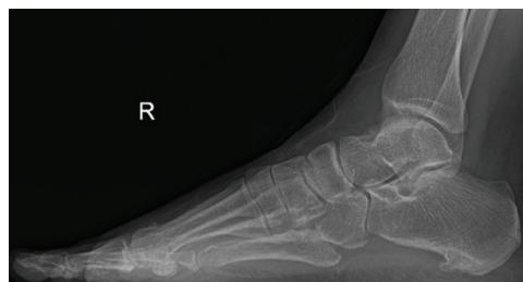
Figure 5: Plain radiograph taken 5 months post-surgery showing a healed calcaneum.

Surgical debridement and drainage was performed, with findings of 1cc intramuscular pus between the right flexor digitorum brevis plantar fascia ( Figure 4 ). The plantar fascia also was observed to have fibrotic changes. A culture revealed Methicillin-Resistant Staphylococcus Aureus (MRSA) with a sensitivity to the antibiotic Vancomycin. The patient was treated with Vancomycin intravenously for 1 week and later completed 6 weeks of oral Fusidic acid and Rifampicin. She recovered well and could ambulate in regular shoes with a silicone heel pad without pain. The wound healed with a painless thin scar. A follow-up radiograph nearly one year of surgery showed a healed calcaneus ( Figure 5 ).