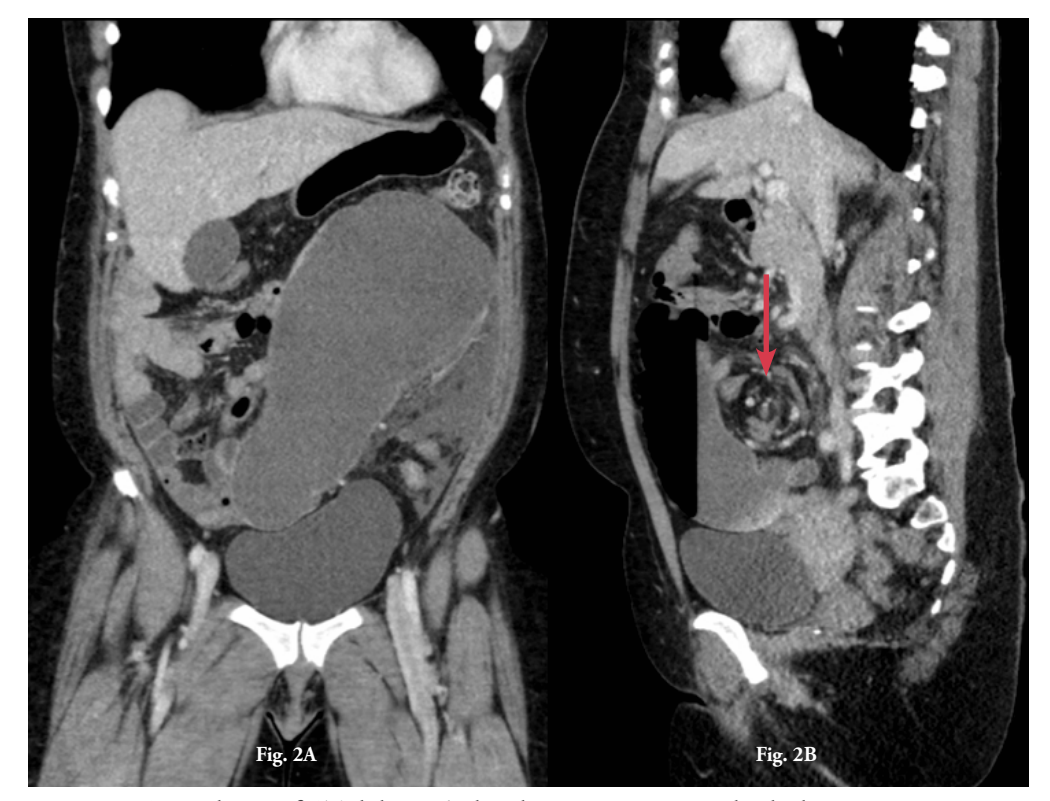
Figure 2a: Coronal view of CT abdomen/pelvis demonstrating a caecal volvulus. Figure 2b: Sagittal view of CT abdomen/pelvis showing the "whirl sign" (arrow) of the mesentery.

The surgical team was consulted when her abdomen became more distended. On examination, her vital signs were within normal limits. Her abdomen was moderately distended but soft. There was mild tenderness around the central abdomen. The blood investigation was unremarkable, except for a mild leucocytosis of 14.6 (109/L). An abdominal x- ray (Figure 1) showed a very large, fluid-filled loop of large bowel with an air fluid level typical of a caecal volvulus. A computed tomography (CT) ( Figures 2 &3 ) of the abdomen/pelvis subsequently confirmed a caecal volvulus with oedematous mesentery.