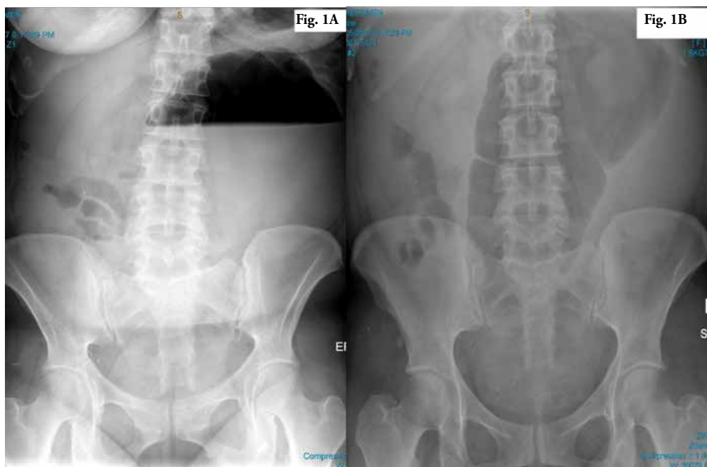
Figure 1a: Erect abdominal x-ray showing a dominant, dilated large bowel loop with air fluid level. Figure 1b: Supine abdominal x-ray demonstrating a dilated large bowel loop from the right lower pelvis to the left upper quadrant.

A 56-year-old woman presented to the hospital with lower abdominal pain and distention over the past 2 days. She described having difficulty with opening her bowels initially, and her abdominal distention was worsening gradually. Her abdominal pain was central and colicky, with no associated symptoms. There was nausea but no vomiting. She had undergone an uncomplicated dental procedure 2 days prior and was discharged home on the same day. She had been taking Paracetamol/Codeine