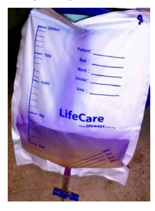
Figure 2 : Purple discoloration of the urine, urine bag and tubing.