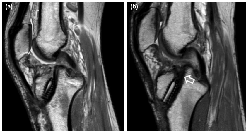
Fig. 2: MRI images of tibial tunnel with graft in situ of a participant. (a) Pre-ESWT with no incorporation and, (b) was the post-ESWT that demonstrates partial incorporation (open arrow).