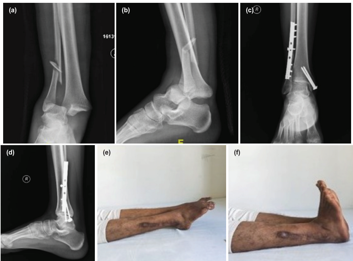
Fig. 2: (a, b) Pre-operative radiograph of a 20-year-old male showing ankle fracture dislocation and (c, d) the follow-up radiograph at the end of one year. (e, f) Shows the clinical ankle range of motion at the final follow-up.