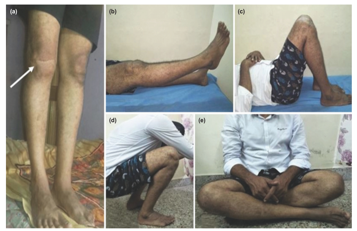
Fig. 3: At final clinical follow-up of 15 years showing the patient, (a) standing with both knees in alignment (white arrow pointing to the right knee with a healed transverse laceration), (b) actively extending his right knee till 0° with no lag, (c) with right knee flexion of 130°, (d) squatting and (e) sitting cross-legged.

articular extent of the fracture, unavoidable consequences like knee stiffness and early arthritis in the future, the distal femur hardware was removed in the same sitting. Radiographs following implant exit showed a well-united fracture without arthritic changes in the knee (Fig. 2(a) and (b)).