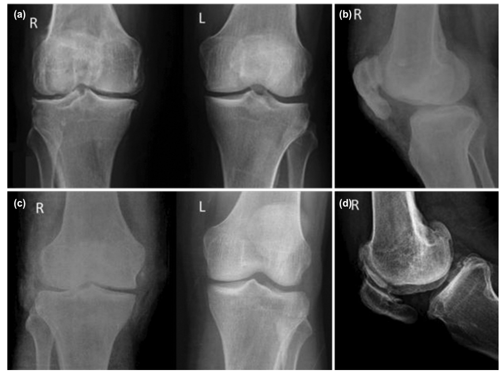
Fig. 2: At one month following implant exit, (a) AP view of both knees (R-Right, L-Left) and (b) lateral view of the right knee with no visible arthritic changes in the right knee. At final follow-up of 15 years, (c) AP view of both knees and (d) lateral view of the right knee showing osteoarthritic changes in the right knee (osteophytes around the patella and both femoral condyles).

Fig. 1: Radiographs at initial presentation, (a) Antero-posterior (AP) and (b) lateral view of the right knee showing the bicondylar Hoffa fracture (black and white arrow point to the larger medial condyle and small lateral condyle fragment respectively). Radiographs following anatomical reduction and stable internal fixation with 3 partially threaded 6.5mm cancellous lag screws with 2 washers for the medial condyle and 1 lag screw for the lateral condyle combined with a patella cerclage wire. Immediate postoperative (c) AP and (d) Lateral view of the right knee. (e) AP and (f) lateral view of the right knee at three months following surgery showing well united bicondylar Hoffa and patella fractures.