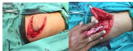
Figure 2: Groin flap prepared and finger implanted into it.