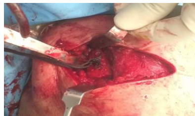
Figure 1: Intraoperative picture

Immediate post operative radiograph showed a well reduced ACJ. Patient was put on an arm sling and physio started 2 weeks post-operatively. At 12 th week follow up, patient had regained full ROM of the affected shoulder and radiograph revealed a well healed dissociation. DASH and Oxford Shoulder scores showed good functional outcome.