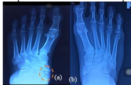
Figure 2: X-ray of Left Foot (a) showed avulsion fracture over left navicular bone, compared to Right Foot X-ray(b)